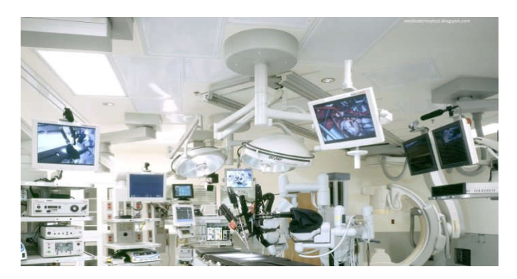
Surgery suites must have a turnkey solution after experiencing a disaster event

Turn-key solutions are key to up-time when as disaster strikes. Having partners is as important as having good insurance and knowledgeable risk managers for hospital operators. Assistance with equipment and networks supplements the BET, Engineering and IT departments allowing them to better focus on the most vital priorities. Areas can be brought back into compliance with a plan. Large disasters may impact an entire wing or building while smaller events may impact an isolated area. Either way you can lean on outside expertise during these times.